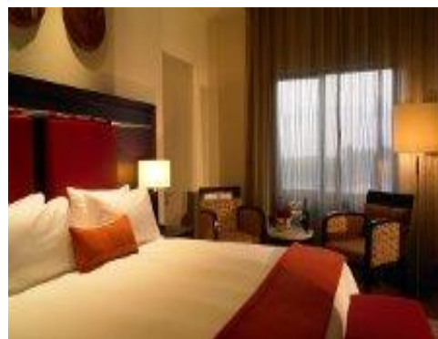
SKI (Superior King Room)

64 Jones Road . Kempton Park . South Africa . P O Box 956 . Kempton Park . 1620 . South Africa Tel +27(11) 928 1000 . Fax +27 (11) 928 1702