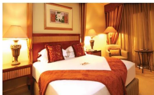
CKI (Classic King Room)