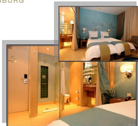
CTW (Classic Twin Room)

64 Jones Road . Kempton Park . South Africa . P O Box 956 . Kempton Park . 1620 . South Africa Tel +27(11) 928 1000 . Fax +27 (11) 928 1702